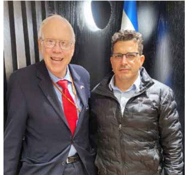
Amichai Chikli, member of the Likud Party and The Ministry for Diaspora Affairs and Combating Antisemitism