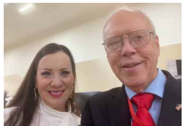
Tally Gotliv, member of the Likud Party; To watch interview with Tally Gotliv, click on the following Rumble link:

https://rumble.com/v61b5dt-israel-mk-tally-gotliv-interview.html