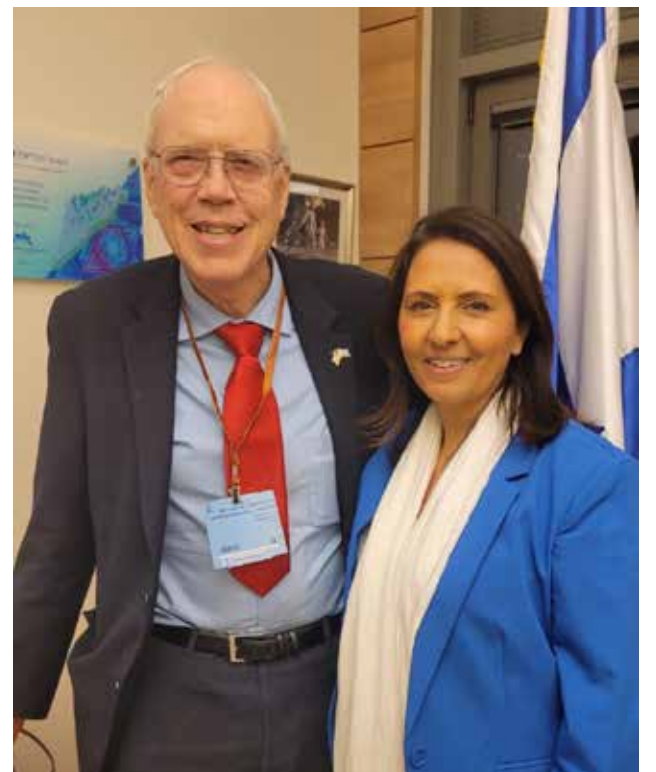
Gila Gamliel, member of the Likud Party and Minister of Innovation, Science and Technology