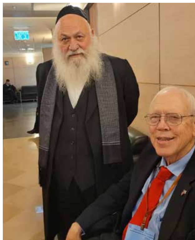
Yitzhak Goldknopf, Head of Ultra Orthodox Party and Minister of Housing;