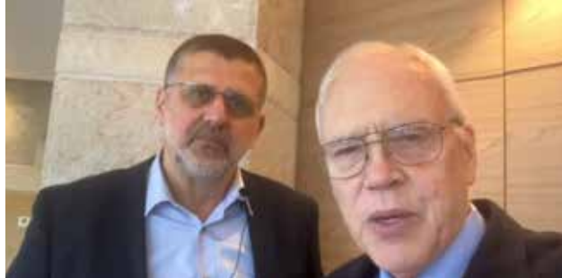
Avihai Avraham Boaron, member of the Likud Party; To watch interview with Avihai Avraham Boaron, click on the following YouTube link: https://youtu.be/a9U3PNHD3Gc