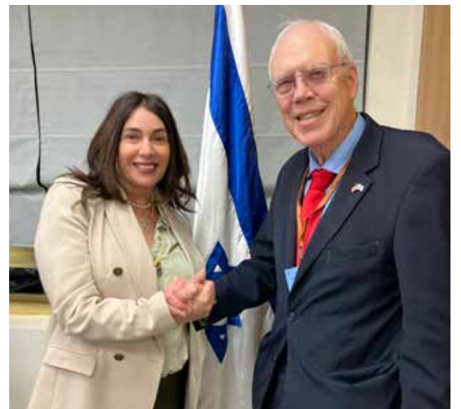
Miriam "Miri" Regev, member of the Likud Party and Minister of Transport, National Infrastructure and Road Safety