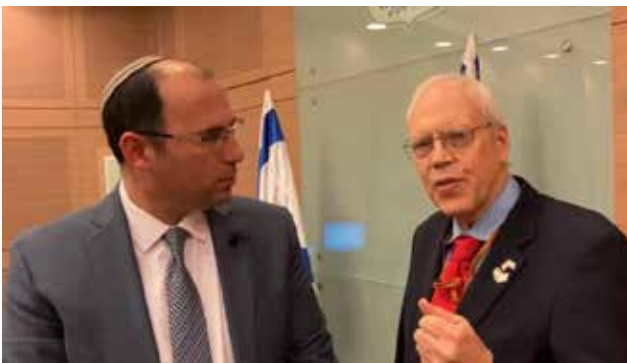
Simcha Rothman, member of the National Religious Party-Religious Zionism and chair of the Knesset's Constitution, Law and Justice Committee; To watch interview with Simcha Rothman, click on the following YouTube link: https://youtu.be/zoI8DEuZAKc