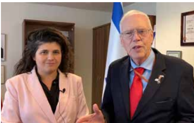
Sharren Haskel, member of the New Hope Party and Deputy Minister of Foreign Affairs; To watch interview with Sharren Haskel, click on the following YouTube link: https://youtu.be/4xPwJtvpafs