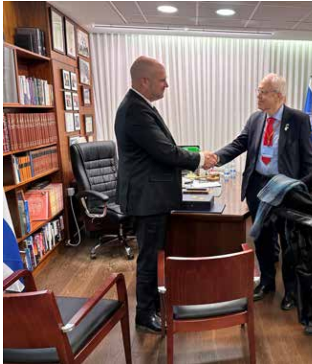
Amir Ohana, member of the Likud Party and Speaker of the Knesset

(JERUSALEM, Israel)— While in Israel, I met with the following Israel leaders (Knesset Members) inside the Knesset building, Jerusalem, Israel regarding their concerns about the rise of antisemitism in light of International Criminal Court decisions condemning Israel and their message to Christians that support Israel. Their overwhelming response was to abhor the decision of the ICC and viewed the ICC's actions as a form of Jew hatred. The Knesset members expressed tremendous gratitude for Evangelical Christians supporting Israel.