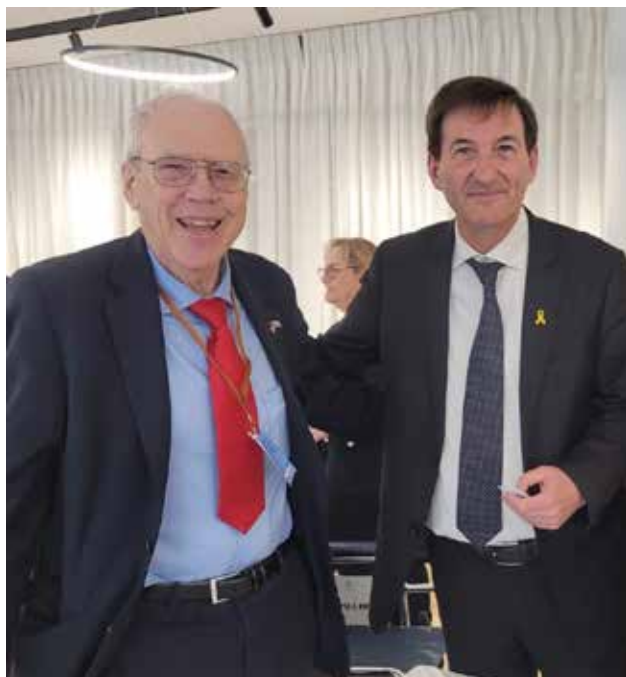
Boaz Bismuth, member of the Likud Party and Chairman of Drug Addiction Knesset Committee