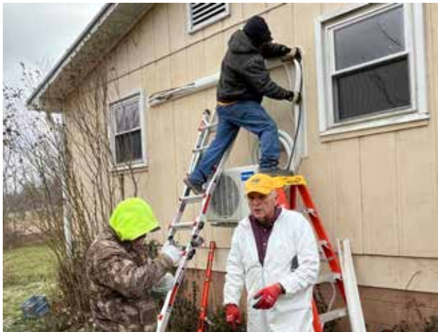
A six-person team of skilled Utah tradesmen made the trip to Hurricane Helene devastated areas of western North Carolina last week to help get four families back into their homes before Christmas